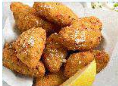
Crispy Fried Artichokes