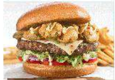
Crispy Jalapeño Burger