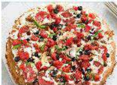
BJ's Favorite Deep Dish Pizza

Valid for dine in or take out. Not valid towards alcoholic beverages or Happy Hour specials. Please do not distribute flyers on site during the event. Flyers must be printed and presented to the server.