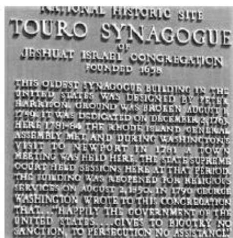
National Historic Plaque at Touro Synagogue, (Newport, RI)

- Pres. George Washington to the Hebrew congregation of Newport, 1790