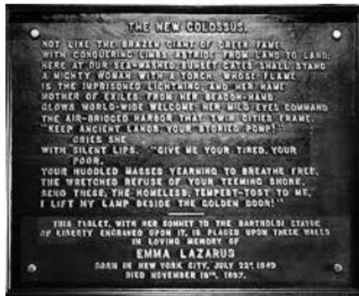
Plaque on Statue of Liberty's pedestal

3 Av – Birthdate of Emma Lazarus in 1849 CE. A student of literature, German, French, and Italian, she was a famous poet, novelist, playwright and author. She was also socially active with the Hebrew Emigrant Aid Society, co-founded the Hebrew Technical Institute, and espoused creation of a Jewish state 13 years before Herzl! She is best remembered for her poem "The New Colossus", written to raise funds for the Statue of Liberty's pedestal on which her words are engraved.