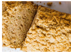
Brown Sugar Crumble Zucchini