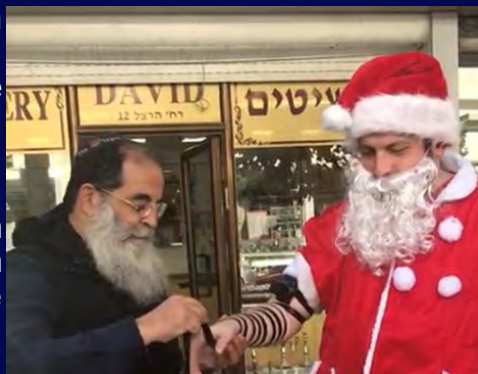
Everyone gets caught up in the holidays wearing Tefillin

Tefillin are not worn on Shabbat and major Jewish holidays (including Chol Hamoed, according to many).