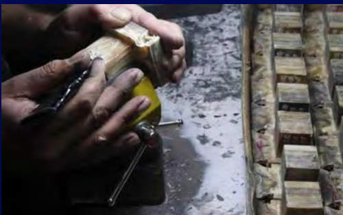
A craftsman known as a batim macher works on the protruding Shin on a head tefillin

You'll notice that the head tefillin has the Hebrew letter Shin (ש) on both sides, one with three branches, and the other with four.