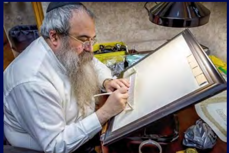
A trained scribe inspects a tefillin scroll

4. Vehayah (Deut. 11:13–21) : Focuses on G-d’s assurance to us of reward that will follow our observance of the Torah.