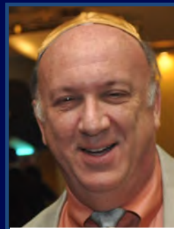
Bruce Rouman President of CBS

I was reading how the Hebrew language took off as the national language of Israel. Enjoy.