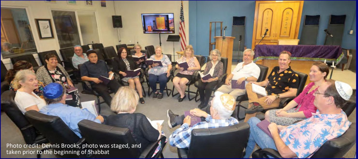
photo was staged, and taken prior to the beginning of Shabbat