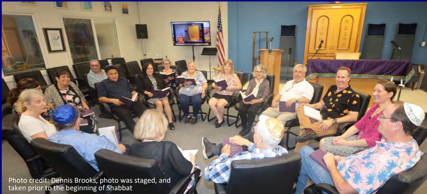
photo was staged, and taken prior to the beginning of Shabbat