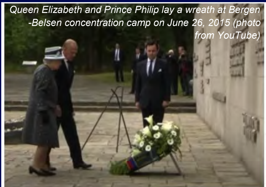
Queen Elizabeth and Prince Philip lay a wreath at Bergen-Belsen concentration camp on June 26, 2015