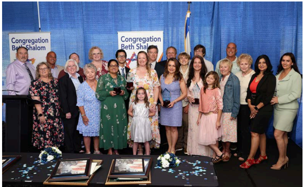
2026 Legacy Luncheon Honorees